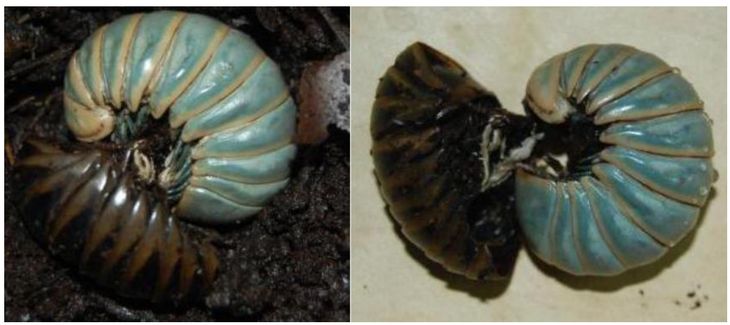
Fig. 3. Moulting phases of Arthrosphaerafumosa in the laboratory.

International Journal of Agricultural Technology 2013, Vol. 9(1): 61-79