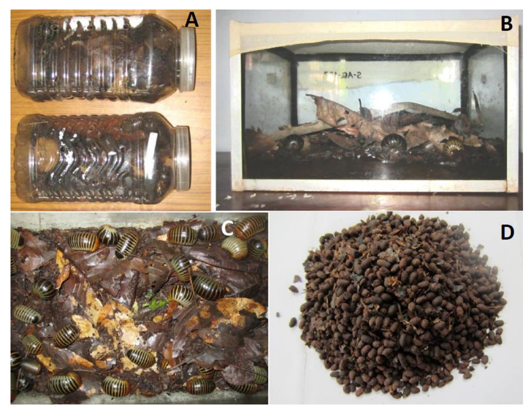
Fig. 4. Containers used in the laboratory to maintain pill-millipedes: animals feeding leaf litter in plastic bottles kept horizontally (A) and in a glass tank (B), close view of millipedes feeding on leaf litter (C) and heap of faecal pellets (D).

As a first step, ex situ maintenance of pill-millipedes has been attempted in our laboratory. We maintained four species of pill-millipedes in two types of containers. Plastic boxes (30\times15\times15 \text{ cm}) kept in horizontal position (to have more space for movement) with decomposing mixed leaf litter is ideal condition to maintain 5-10 pill-millipedes (Fig. 4A). Plastic containers need holes on the top and sides for aeration and to supply a small quantity of water. This set up are also help to study leaf ingestion and faecal pellets production using various detritus with pill-millipede combinations (Fig. 4C, 4D). It is also possible to use the abandoned glass aquarium tanks ( 60\times30\times30 cm) to maintain 25-50 pill-millipedes with a thin mesh or cloth cover on the top (Fig. 4B). Four pill-millipedes ( Arthrosphaeradisticta, A. fumosa, A. magna and Arthrosphaera sp.) were maintained on mixed leaf litter diet in glass tanks in laboratory conditions (temperature, 26-28°C) up to one year. The rate of survival was assessed on monthly intervals and survival was above 98% for the